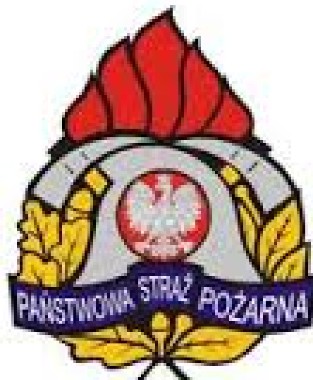
Figure 1: Symbol of the Polish State Fire Service.