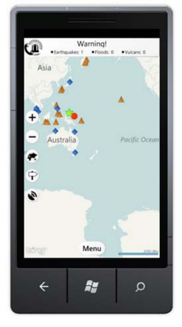
Figure 2: The application running in the mobile device emulator