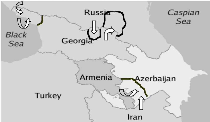
Figure 4: Weapons trafficking routes in the Caucasus

particularly engaged in weapons smuggling (among other activities) within their operation areas, which include Mingrelia, the Gali district, and the Kodori Gorge in western Georgia. Similar phenomena take place in Chechnya and Dagestan, where local terrorist and insurgent groups purchase weapons from Russian sources and disperse them to the population for operational or commercial purposes. At the same time, some high-end weapons, like man-portable air defense systems (MANPADS), are smuggled into Chechnya and Dagestan from abroad. In the summer of 2002, Chechen insurgents managed to smuggle several dozen MANPADS across the Georgian-Russian border to Chechnya. The Chechen insurgents subsequently shot down several Russian helicopters, resulting in the loss of a high number of personnel and posing serious implications for operations, which lasted until the end of the year. 25