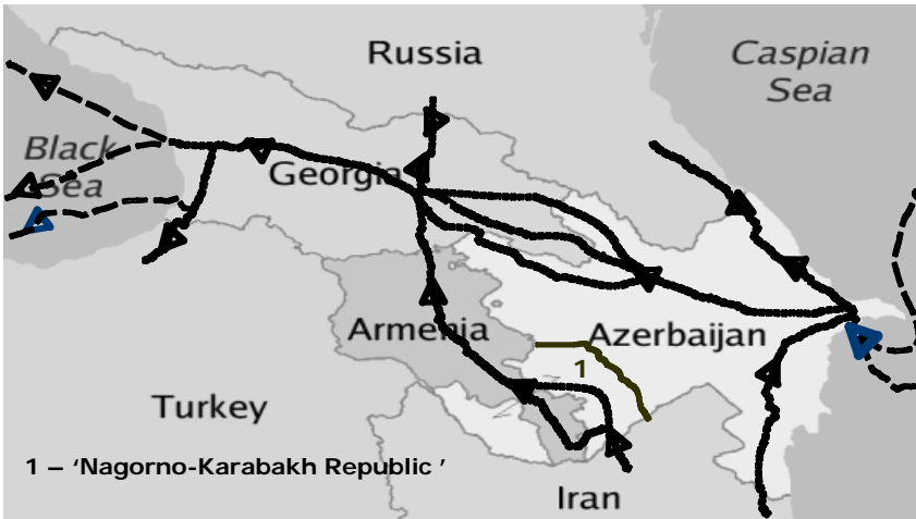
Figure 5: Drug trafficking routes in the Caucasus

ther in person by couriers (e.g., within the human body) or in unaccompanied commercial cargo shipments. The items trafficked range from low-grade, label “555” heroin to high-quality, label “999” heroin. There is also an increasing flow of cannabis from Iran, as well as cocaine and marijuana from Russia, which is mostly delivered by messengers, arriving by legal means of transportation, such as automobiles, trains, or ferries. The pool of traffickers is international. Perpetrators detained for drug-related crimes in the first half of 2006 in Azerbaijan (in addition to local citizens) included forty-seven foreign nationals (twenty-three from Georgia, fifteen from Iran, and others from Russia, the Central Asian states, and Afghanistan). 28 Azerbaijan pays a high price for its strategic position, one negative backlash of which is the transit of illicit drugs, many of which filter into the Azeri population. There are 300,000 drug users in the country, among them 15,000 to 18,000 (including teenagers) who are addicted to hard drugs. 29 Over the last year, drug-related crime rates in Azerbaijan rose by more than nine percent. The drug issue has risen to a national-level security threat. (For the main drug trafficking routes in the region, see Figure 5.)