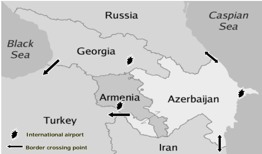
Figure 6: Human trafficking routes in the Caucasus