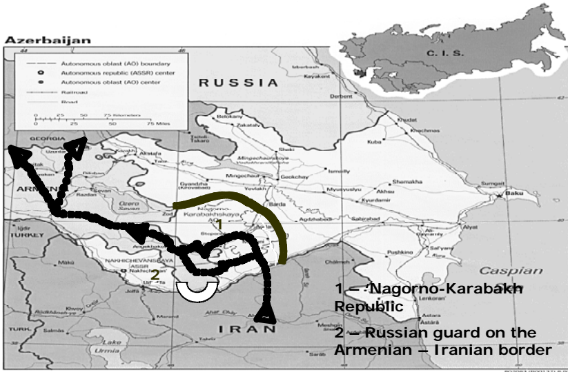
Figure 7: The Nagorno-Karabakh “black hole”

package financed by the Export Development Bank of Iran. 46 From this vantage point, smuggled goods (or people) can move out of Armenia via the only two available routes: either the Megri-Goris-Yerevan-Tbilisi route (Route E-117) or the Megri-Yerevan-Ashtarak-Kutaisi route (Route A-82). Georgia thus serves as a “distribution center” to the outside world, providing a link to Turkey, Russia, Ukraine, and Western Europe.