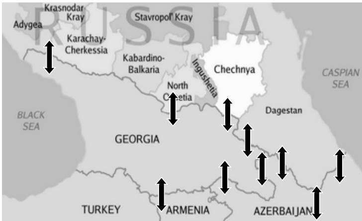
Figure 2: Cross-border ethnic kinship

veillance system in the Nakhchevan enclave will be introduced no earlier than 2010. 14 The Azeri-Turkish border, however, being a mere fifteen kilometers wide and having only a single border-crossing point at Sadarak, is firmly controlled.