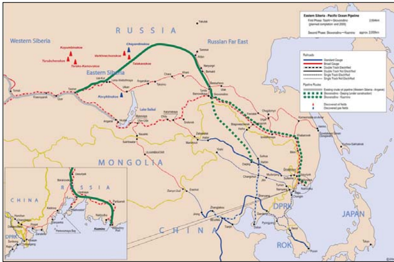
Figure 3: Eastern Siberia – Pacific Ocean Oil Pipeline (ESPO oil pipeline). 47

Regional Maritime Security Initiative (RMSI) and Five Powers Defense Arrangement (FPDA) with Malaysia, Singapore, Australia, New Zealand and United Kingdom. 48 ASEAN’s legitimacy in the eyes of the US and the Five Powers represents a factor of containment of piracy, but also demonstrates Western economic interests in the region. To a certain extent, these interests are mutual with those of China, but when the issue of Taiwan and the Spratley Islands is added to the mix, there are also factors of significant competition.