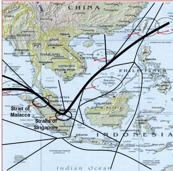
Figure 2: Sea Lines of Communication in the South-East Asia. 43

No doubts the Straits of Malacca and Singapore are the real chokepoints of SLOCs connecting the Indian and Pacific Oceans. 44 The Strait of Malacca regarding the flow of oil is smaller only when compared to the Strait of Ormuz, having 50 000 big trade ships yearly crossing the waters, including 40-50 tankers per day 45 providing total 80% of oil to China, Japan and South Korea. At present the threat is connected only with piracy there and in the South China Sea. However, as a result of The Association of Southeast Asian Nations (ASEAN) actions in the area the threat is no longer significant one. In 2004 ASEAN started operation “MALSINDO” with 17 warships from Indonesia, Malaysia and Singapore; next in 2008 Thailand also joined it. The operation turned into the Malacca Strait Patrols (MSP) 46 which included three essential elements: the Malacca Strait Sea Patrols (MSSP), the “Eyes-in-the-Sky” Air Element (September 2005) and an Intelligence Exchange Group (2006). Such multidimensional and international approach along with regulations provided a quick reduction of piracy. Moreover, it was supported by other countries out of the area, including the US-lead