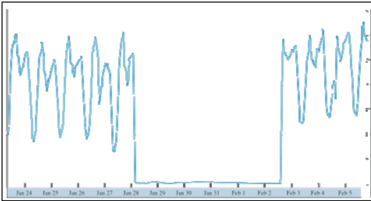
Figure 3: Egyptian Internet Traffic between 28 January and 2 February 2011.

mands. On 11 February, a day of massive ‘Friday of Departure’ demonstrations, Mubarak was finally forced to resign.” 38