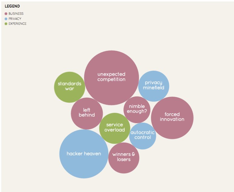
Figure 3: Challenges for the IoT.